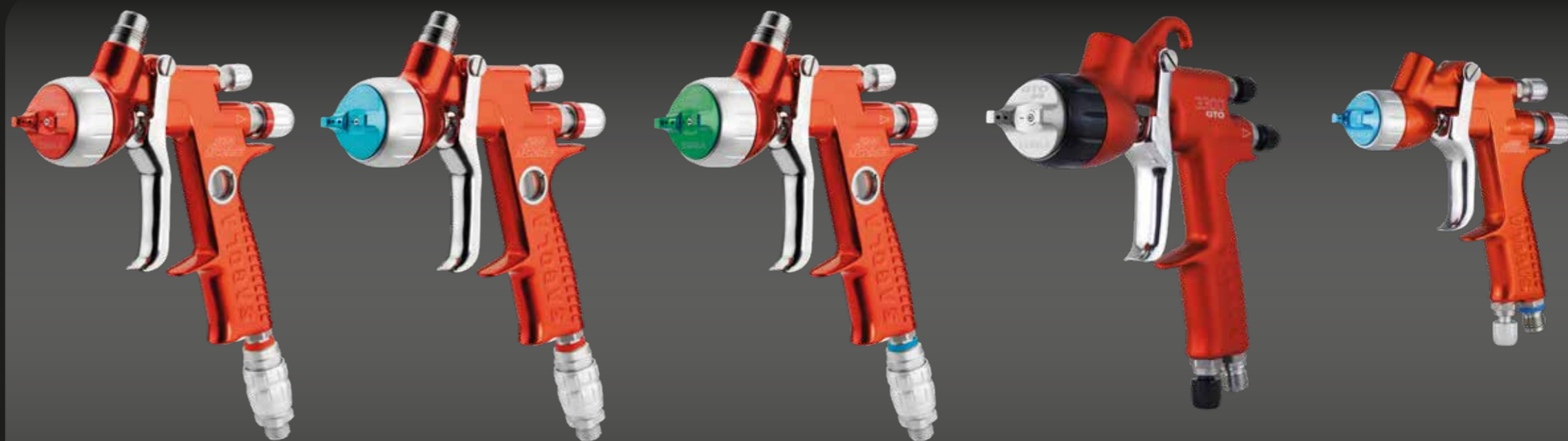
4600 XUREME HS