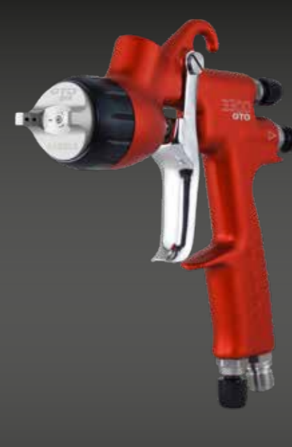
3300 GTO PRIMER