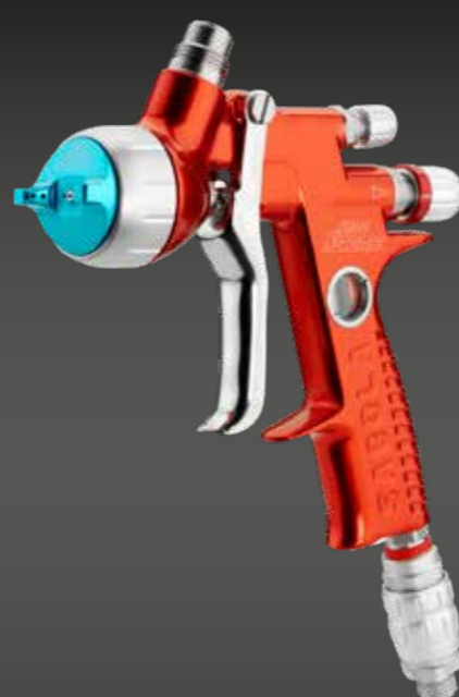
4600 Xtreme WATER