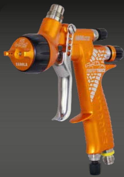
4600 TROPHY TRUCK TITANIA PRO