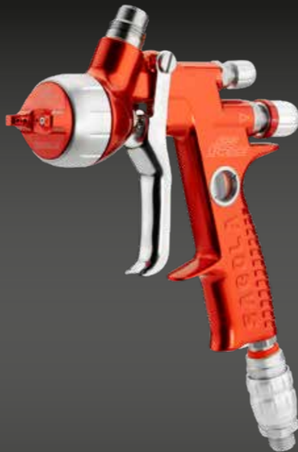
4600 Xtreme CLEAR