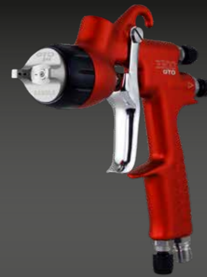
3300 GTO PRIMER