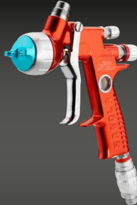
4600 Xtreme AQUA