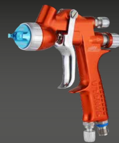
mini Xtreme SPOT REPAIR