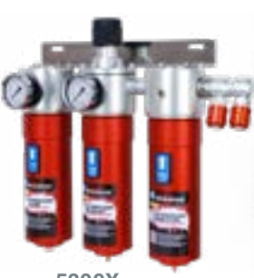
5300X Ref. 10730305

COUPLINGS For disposable deposits. "PPS" types