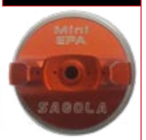
High speed and low viscosity applications. Ideal for any type of clearcoats.