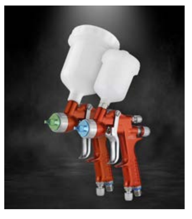
*500 ml. reusable plastic gravity cup with product filter