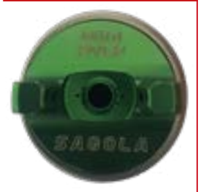
High volume and low pressure applications. Ideal for waterborne or express drying. (HS) products.