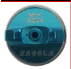
Waterborne products, regardless of the level of viscosity, for an even distribution of paint.